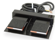
TWIN WITH WIRED CHANNEL